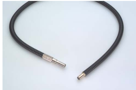
Flexible light guide single