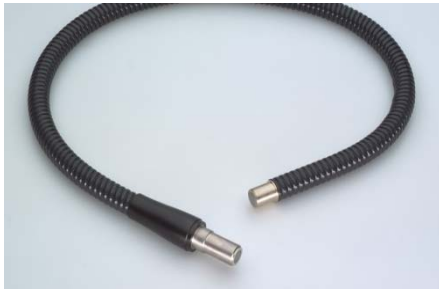
Flexible light guide for KL 2500 LCD